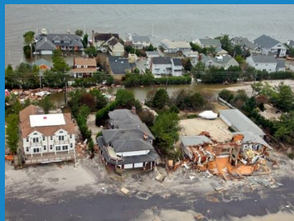
In August of 2005, Hurricane Katrina flooded the city of New Orleans, Louisiana, damaging or destroying over 100,000 homes and causing $108 billion in damage.

The National Environmental Health Tracking Network integrates data from a variety of sources pertaining to health conditions (e.g. asthma and birth defects), environmental exposures (e.g. blood lead levels), and environmental hazards (e.g., air pollution). 16 This data enables researchers and health authorities to pinpoint localities with environmental health problems and to track problems over time.