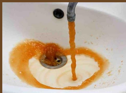
Most water systems damage, like in Flint, Michigan, could be prevented with the proper investments, regulations, and enforcement.

Biomonitoring—analysis of human specimens to detect exposure to environmental toxicants—plays a critical role in lead poisoning surveillance in children and adults. 43 Data collected through the National Health and Nutrition Examination Survey show background levels of exposure for a typical (noninstitutionalized) US resident to more than 200 environmental chemicals. This baseline data complements state- and local-level biomonitoring data, which may show spikes in exposure for certain populations. Few states, however, have an adequate biomonitoring program, and not all test for lead exposure.